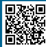
B. S. Patel Polytechnic