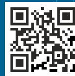
Aerial walk-through of University Campus (300 acres lush green campus)